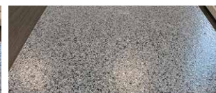
Signature 1/16" NIGHTFALL with LABFENDER