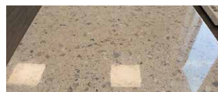
Terrazzo ARMADILLO Flooding