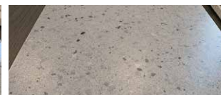
Terrazzo DENALI with LABFENDER 240