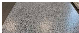
Signature 1/16" NIGHTFALL