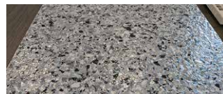
Signature 1/4" NIGHTFALL