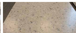
Terrazzo ARMADILLO with LABFENDER 240