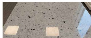
Terrazzo DENALI Flooding